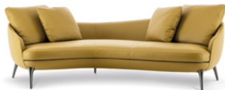
02 RAPHAEL INCLINED SOFA CM 247X135 H88