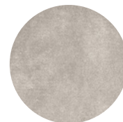
08 DIBBETS RUG Ø CM 450