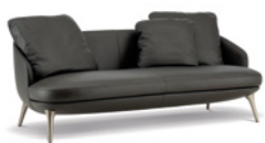
01 RAPHAEL SOFA CM 192X91 H88