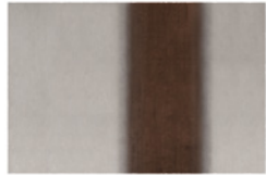
10 LANDFIELD STRIPES RUG CM 600X400