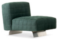
06 TWIGGY LARGE ARMCHAIRS CM 84X90 H66