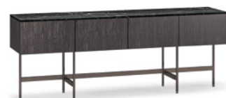
10 KENNETH DINING SIDEBOARD CM 240X55 H90