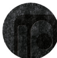
9 WISP RELIEF RUG Ø CM 500