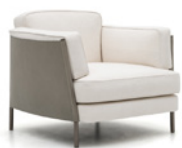
3 SHELLEY ARMCHAIR CM 85X87 H70