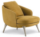
02 RAPHAEL ARMCHAIRS CM 74X86 H78