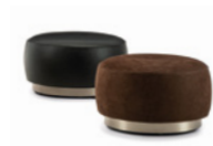
03 TORII BOLD MEDIUM OTTOMAN Ø CM 71 H41