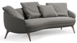
01 RAPHAEL ANGLED SOFA CM 227X118 H88