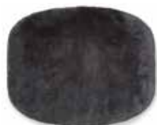
11 DIBBETS "TONNEAU" RUG CM 400X300