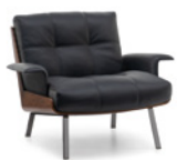
02 DAIKI ARMCHAIRS CM 93X91 H69