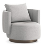
02 TORII BOLD SWIVEL LARGE ARMCHAIRS CM 94X94 H82