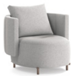
03 TORII BOLD MEDIUM ARMCHAIRS CM 88X88 H82