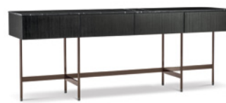
10 KENNETH LIVING SIDEBOARD CM 240X55 H90