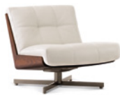
04 DAIKI SWIVEL ARMCHAIRS WITHOUT ARMRESTS CM 73X91 H69