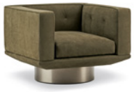
03 SALLY SWIVEL ARMCHAIRS CM 86X84 H63