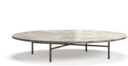
05 LELONG 23 COFFEE TABLE Ø CM 150 H28