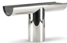
08 PILOTIS CONSOLLE CONSOLE TABLE CM 140X36 H75