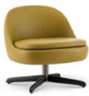
03 SENDAI SWIVEL LOUNGE ARMCHAIRS CM 65X67 H67