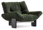
04 EMMI ARMCHAIR CM 102X93 H75