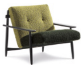
04 TRIO ARMCHAIRS CM 80X90 H75 - MIX "B"