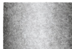
10 WISP SHADE RUG CM 600X450 - SPECIAL SIZE