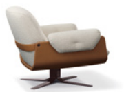
06 LAUREL ARMCHAIRS CM 96X97 H76