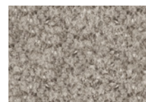
07 WISP RUG CM 500X450 SPECIAL SIZE