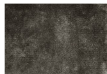
11 DIBBETS RUGS CM 500X350 - SPECIAL SIZE