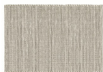
07 OSAKA RUG CM 400X300