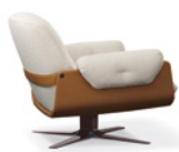
05 LAUREL ARMCHAIRS CM 96X97 H76