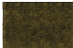
10 FAIRWAY RUGS CM 450X325 - SPECIAL SIZE