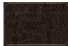
09 OUTLINE RUG CM 600X400