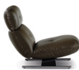
04 LIBRA BERGÈRE CM 78X102 H82