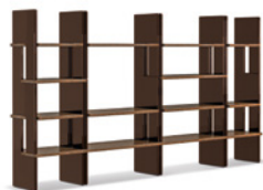
08 ZOE BOOKCASE CM 100X46 H103