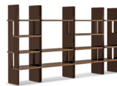
07 ZOE BOOKCASES CM 60X46 H103