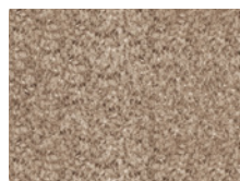
09 WISP RUG CM 450X350 - SPECIAL SIZE