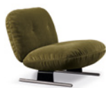
05 LIBRA ARMCHAIR CM 76X86 H73