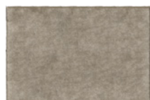
07 FAIRWAY RUG CM 500X400